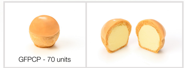
Passionfruit Curd Profiterole