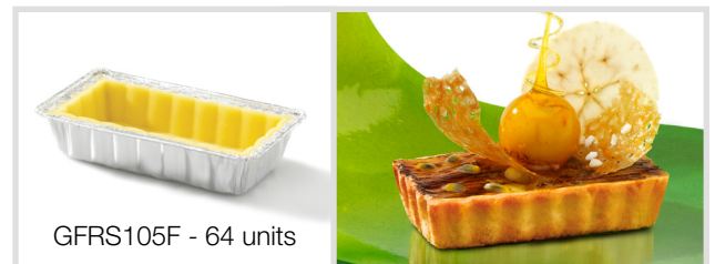
105mm Rectangle Fluted Shortbread Shell