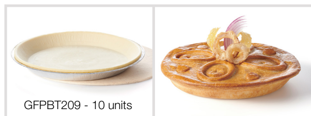
209mm Savoury Pie Shell with matching Puff Pie Top