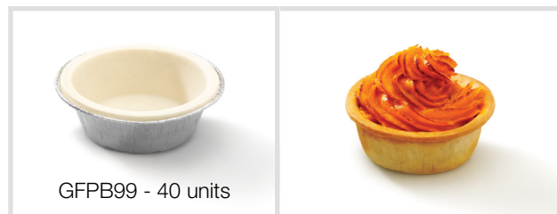
99mm Savoury Pie Shell