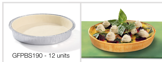
190mm Savoury Pie Shell