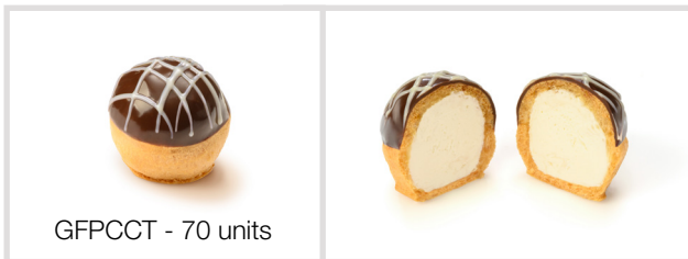
Patisserie Cream Profiterole