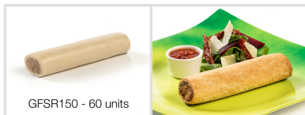
150mm Beef Sausage Roll