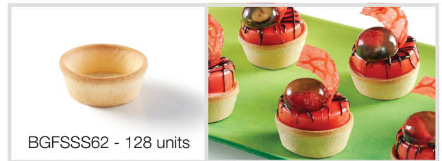
62mm BAKED Shortbread Shell (Straight Sided)