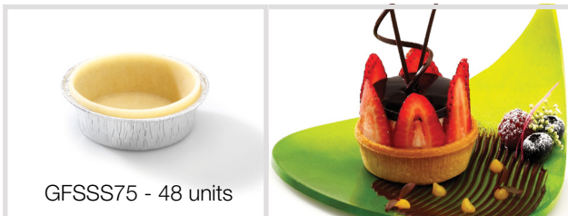
75mm Shortbread Shell (Straight Sided)