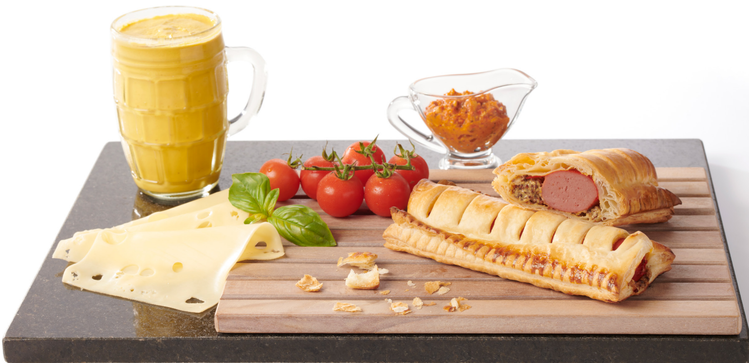
160mm Puff Dog