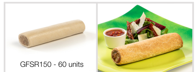
150mm Beef Sausage Roll