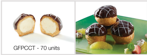
Patisserie Cream Profiterole