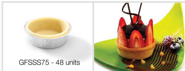
75mm Shortbread Shell