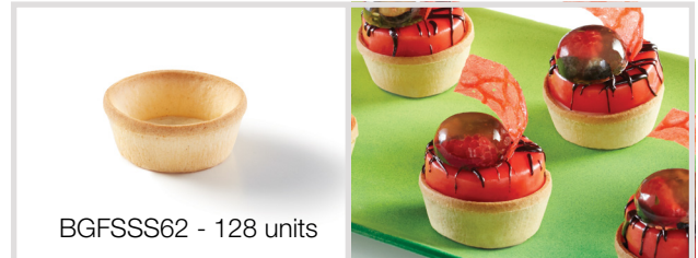
62mm BAKED Shortbread Shell