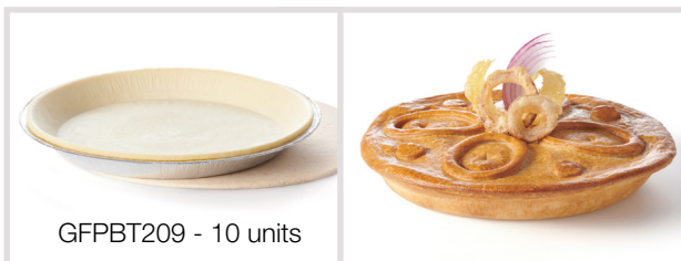
209mm Savoury Pie Shell with matching Puff Pie Top