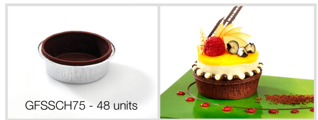
75mm Chocolate Shortbread Shell