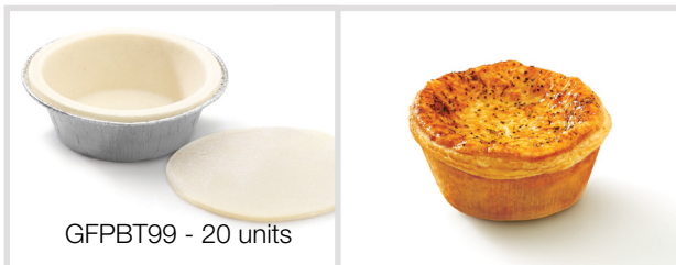
99mm Savoury Pie Shell with matching Puff Pie Top