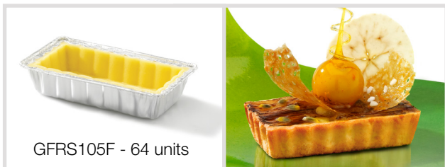
105mm Rectangle Fluted Shortbread Shell