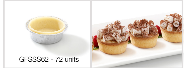
62mm Shortbread Shell