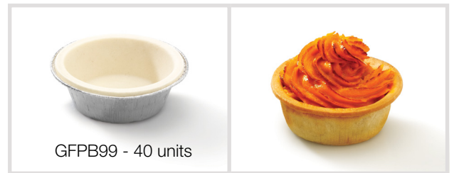
99mm Savoury Pie Shell